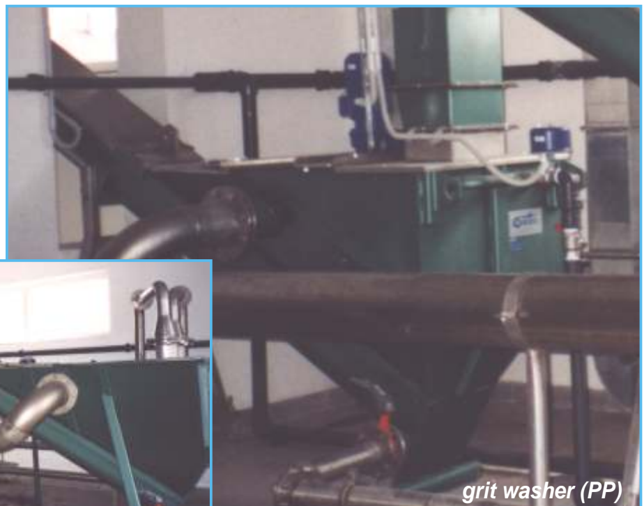
grit washer (PP)