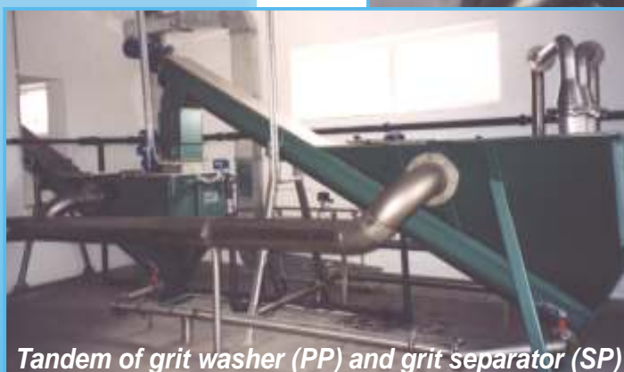
Tandem of grit washer (PP) and grit separator (SP)